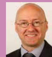
Patrick Harvie MSP