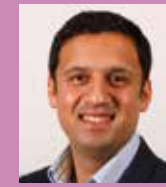
Anas Sarwar MSP