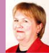
Johann Lamont MSP